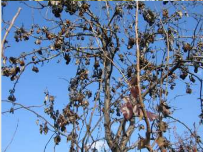
natural infection of Harrow Sweet